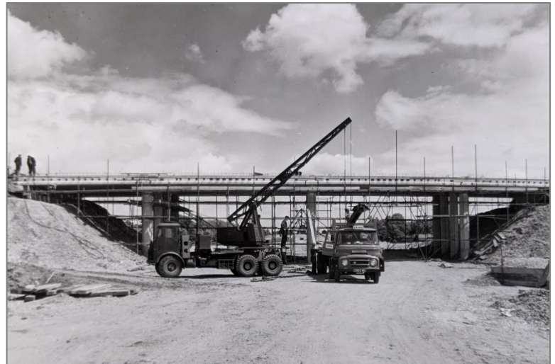
We recently found archive photos of the M4 under construction in 1959-60. These show work underway on the old Monkey Island Lane bridge in mid-1960. If you have old pictures that you'd like to share, please send them to us using the details below.