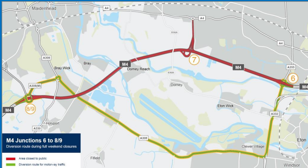
Above: diversion route when the motorway is closed between junction 6 and 8/9

2019 has been a big year for the M4 smart motorway team. We have proceeded at pace with our work and carried out the first three weekend closures of the M4 needed to demolish existing and install new and temporary bridges. Work is now underway along all 32 miles of the smart motorway route and 2020 is set to be an even bigger and more challenging year.